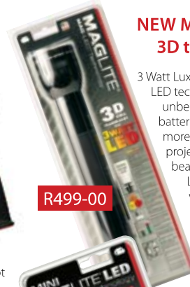
NEW Maglite 3D torch

100W Xenophot bulb. 500,000 Candle power, focus from a Pencil Beam to a Spot