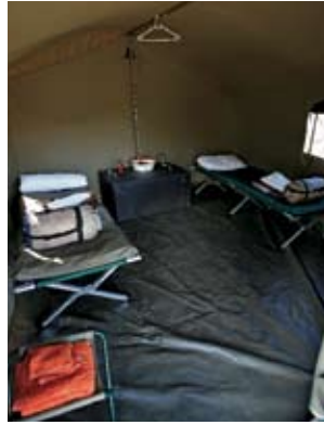
HOME SWEET CANVAS. Your tent on the mountain comes fully stocked with bed, towels and even hot water.

At the minibus, Erika offers us a choice of beer, cider or cooldrink. Then we dump our daypacks in the minibus and walk down the