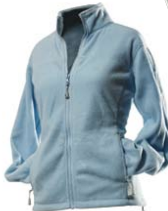
Jeep Fleece from