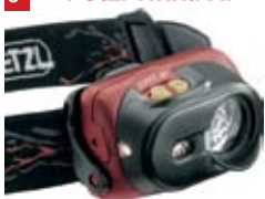
2. Petzl Tikka XP

LED headlamp with 3 lighting levels and boost mode.