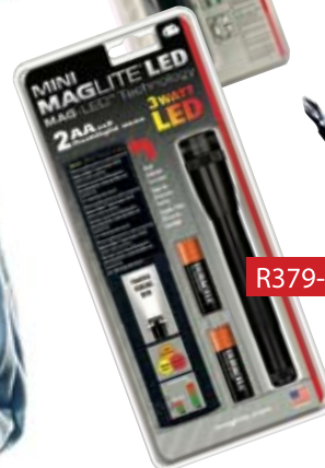
NEW Maglite 2AA torch

3 Watt Luxeon Rebel LED technology, new multi-mode electronic switch providing the user with a choice of peak power beam, 25% low light, flash mode or SOS signal