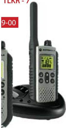
Top 10 gifts for FATHERS DAY 1. Motorola 2 way Radio TLKR - 7