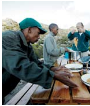
CARBO-LOAD (above). You have to eat quickly on the mountain – the food gets cold fast in the chilly wind.