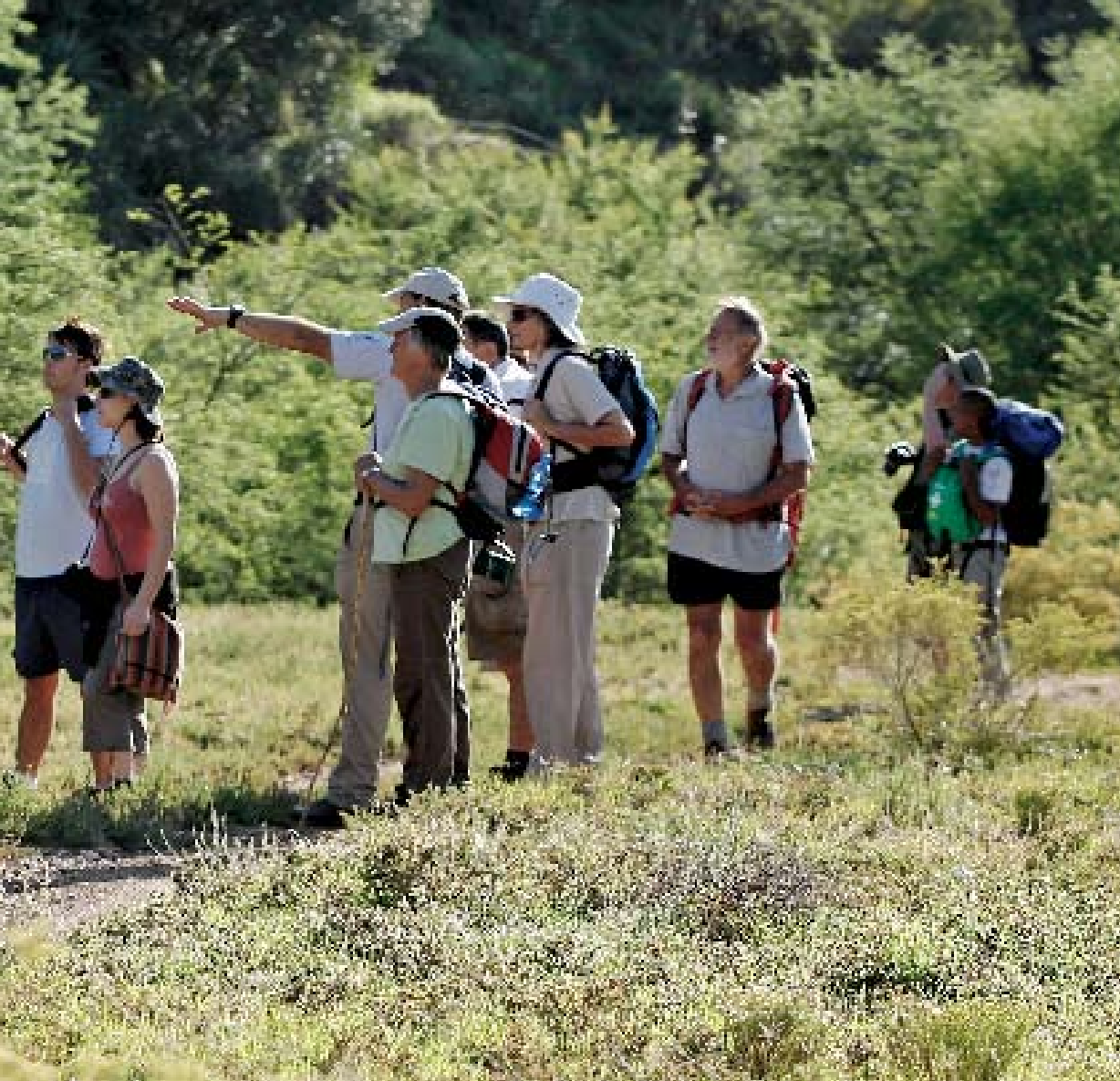
TREAD CAREFULLY (below). The descent into the Gamkaskloof is spectacular – and steep!